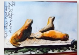
Paulette Nesbitt- Moss Point Seals