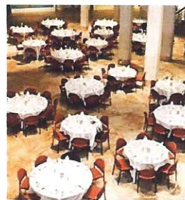
The Marble Hall

The cost for the luncheon is $20 per person, including entrée, beverage, dessert, taxes and service charges.