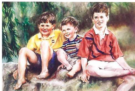
Three Brothers on a Rock

and techniques for painting watercolor portraits.