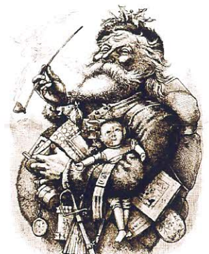
Thomas Nast's Santa