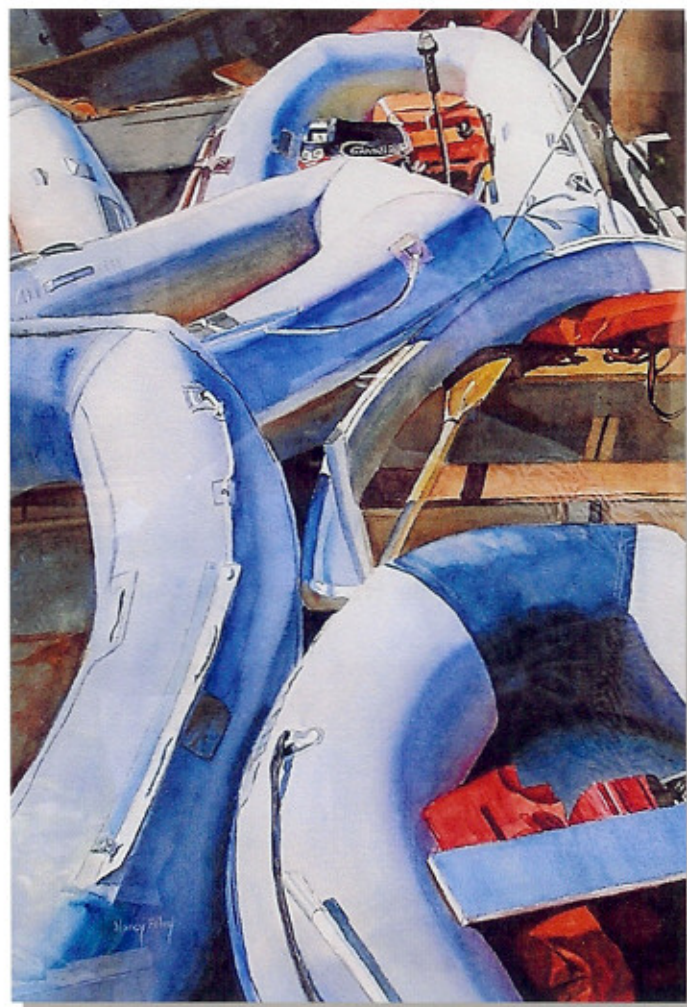
◀ "Back Up" Nancy Foley Watercolor