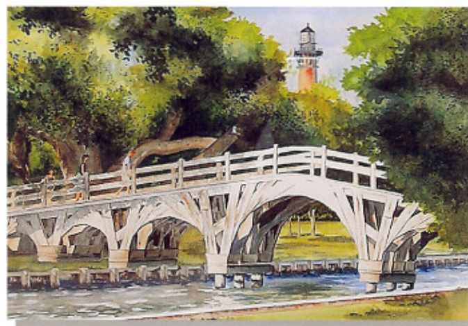
▲ “Whalehead Walk” Tim White Watercolor