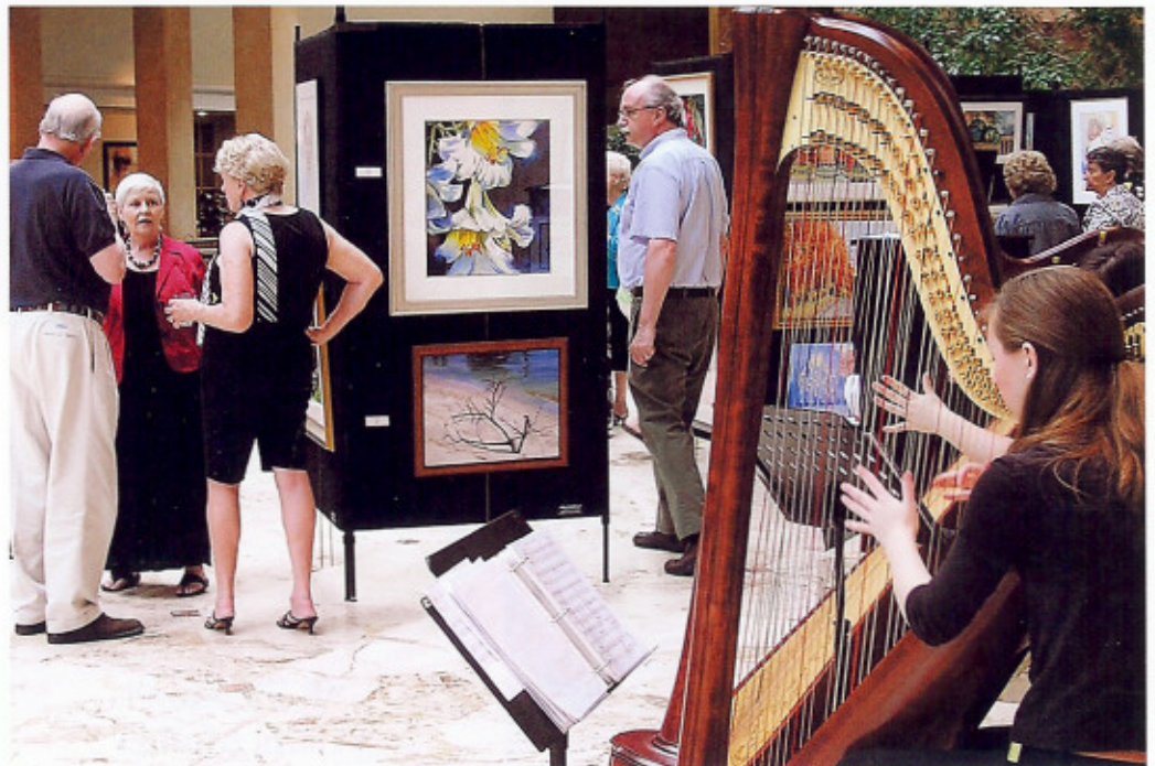
Music and art for a Sunday afternoon