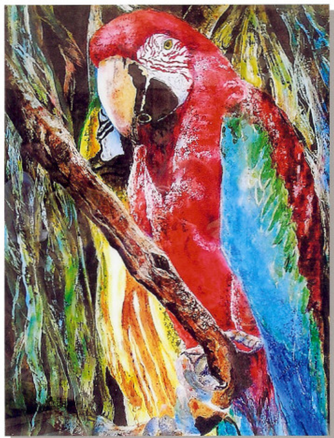
◀ "Parrot Pair" Paulette Nesbitt Acrylic