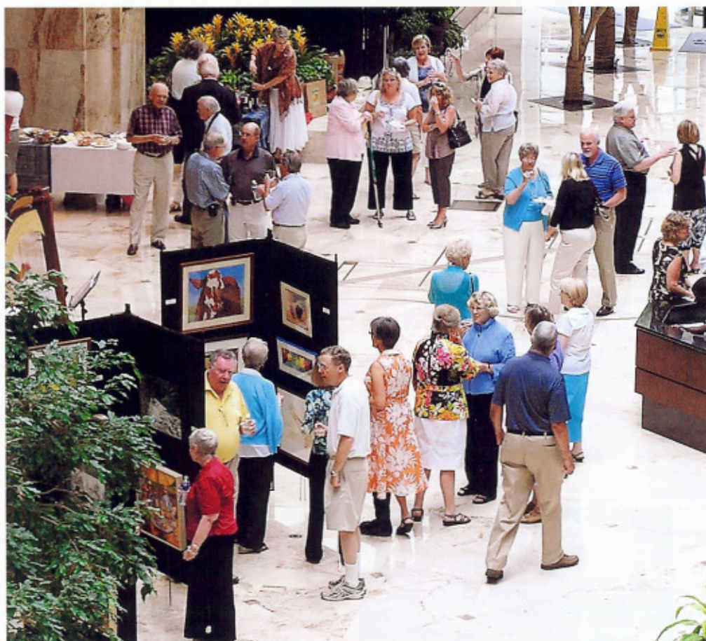
The Atrium of the James Center was perfect place to spend a Sunday afternoon among friends and art