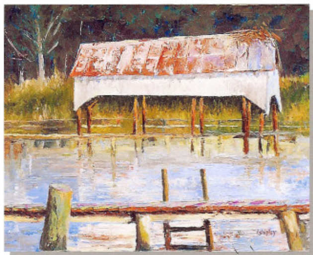
▲ “Rappahannock Reflections” Lois Shipley Oil