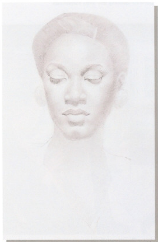
◀ "Reflection" Carol Mullen Pencil