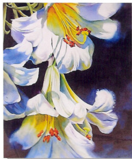
▲ “Wishful Thinking” Beth Bradford Woodblock Print