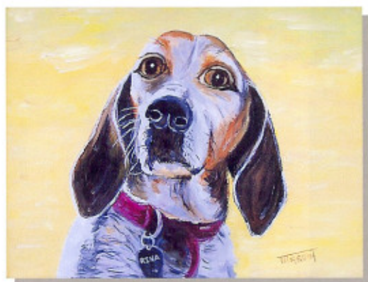
▲ “SPCA's Rina” Margot Titmus Oil