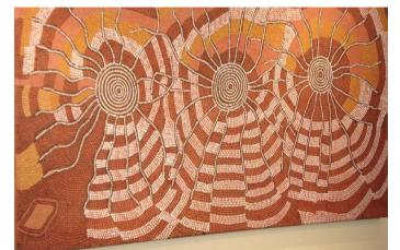
Bush Onion Dreaming