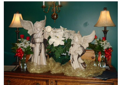
Exhibit at Glenmore Yoga

The first JRAL exhibit of 2010 was hung at the Glenmore Yoga and Wellness Center on Saturday, January 2. This is a new venue for us and the first art exhibit ever for Glenmore. By all reports, the yoga staff and students are extremely enthusiastic about having our artwork on display in their facility.